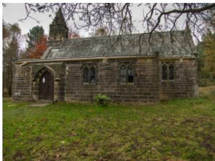
St Mary Magdalene, East Moors