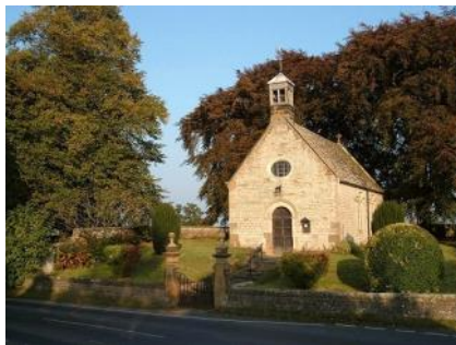
St Chad, Sproxton