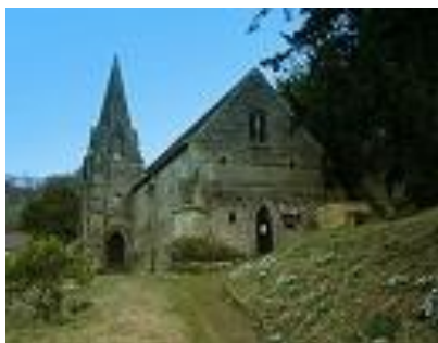
St Mary the Virgin, Rievaulx