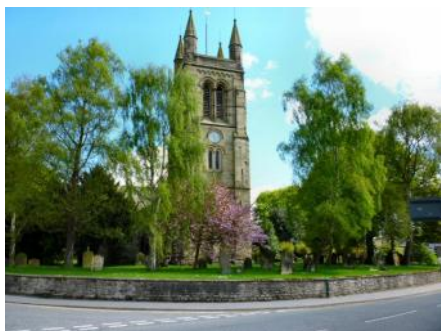
All Saints, Helmsley